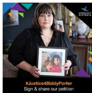
Social Media Graphics