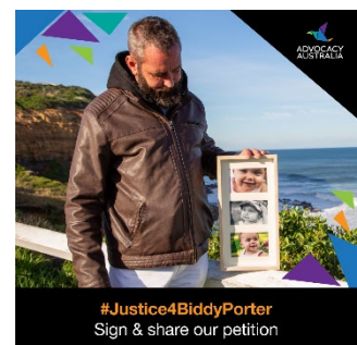
Social Media Graphics